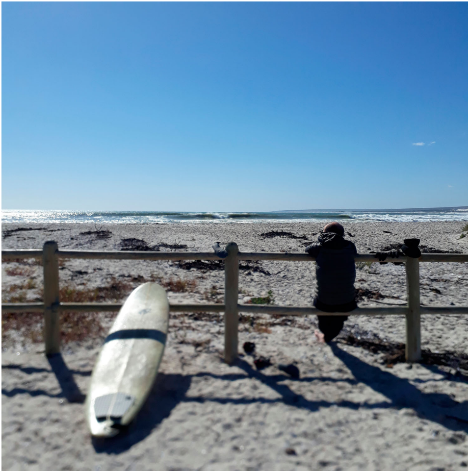
ELANDSBAAI, WEST COAST.

down at Pipeline doing sick bottom turns. The three-time world champion Carissa Moore, resident of Honolulu! Yes undoubtedly, I recognised the open face and the powerful stance: Ms Moore! We had indeed been baptised by greatness, sprinkled with holy water.