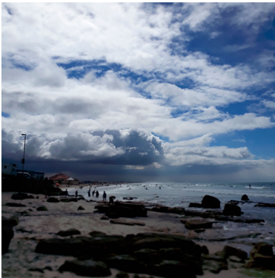
SURFERS' CORNER, MUIZENBERG, CAPE TOWN.

philosophy – has played out in various ways during our surf career to date. He wants grandeur, the Romantic sublime, feats of perfection and beauty. He has known them in his youth, and so expects them, hopes for them again. Any success for me would come, if at all, via attrition and doggedness. But mostly it was undiluted humiliation out there: being whistled off a wave by a seven-year-old, or chucking your board and diving for the bottom as the next set rumbles in near the Koeberg nuclear plant, on a day when no one else is in the water and your car window's already been smashed, when you start hyperventilating to get enough air into your system ahead of what you know is coming: the slow underwater somersaults and icy pirouettes of a long, glorious Atlantic hold down.